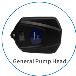
General Pump Head